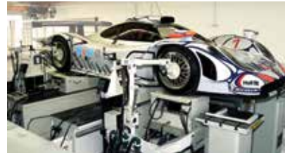
MTS Kinematic & Compliance Test Systems quickly and accurately measure key suspension parameters to help you adjust your setup for maximum driving performance.

As the global leader in suspension characterization and simulation technology, MTS can help. In fact, more test labs around the world use our systems than all others combined. We're the only company that can help you both test your designs and fine-tune your race setups.