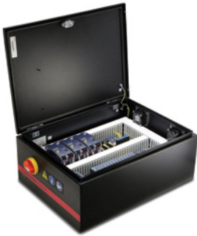
MTS SafeGuard 273 Processor