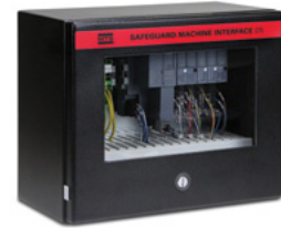
MTS SafeGuard 275.295 Machine Interface for the MTS Series 295 HSM