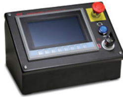
MTS SafeGuard 274 User Interface