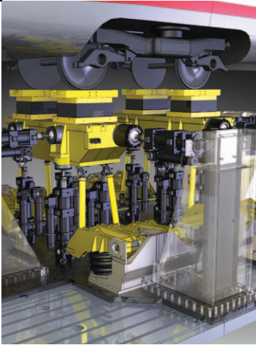
MTS Bogie Measurement Test System

How sophisticated bogie measurement is redefining expectations for innovative new designs