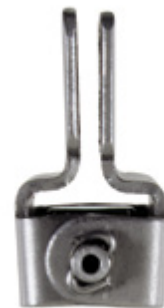
Model 10B (with no rubber face material), jaws parallel