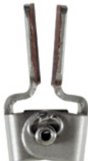
Model 10B, (with rubber face) fully open