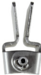
Model 10A, fully open