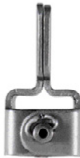
Model 10A, jaws parallel