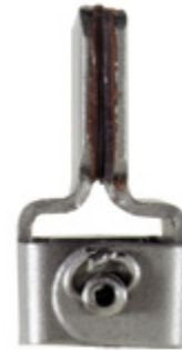
Model 10B, (with rubber face) jaws parallel