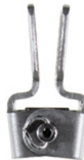
Model 10B, fully open