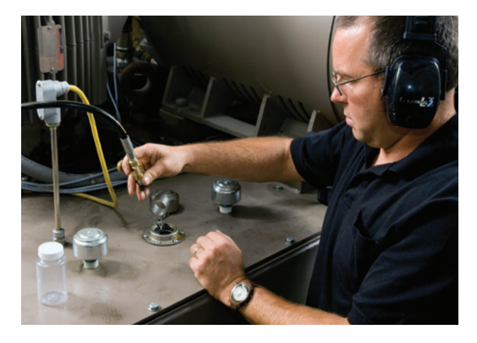
Enjoy the Benefits of Well-Maintained Hydraulic Fluid

Have MTS help manage your hydraulic fluid so that you can concentrate on managing your test schedule and budget. By investing in regular fluid monitoring, you minimize the risk of unpleasant budget surprises or unexpected downtime due to worn or damaged components or systems.