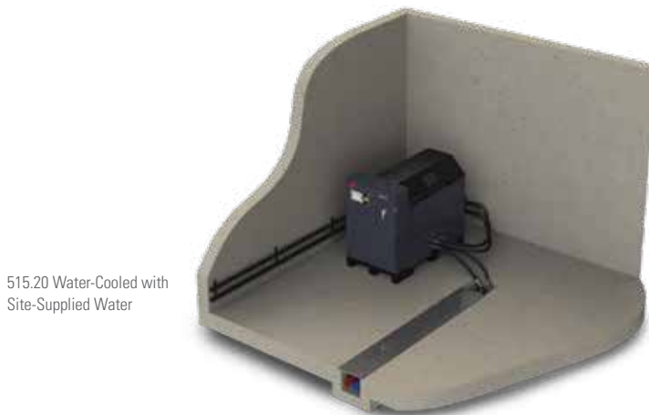
515.20 Water-Cooled with Site-Supplied Water

This energy-saving option is a good alternative in moderate climates. The MTS standard packages for air cooling are designed to be used in a sheltered outside installation and require the site to supply a separate three-phase power feed. All standard air cooling packages operate at temperatures from -7^{\circ} to 40^{\circ}\text{C} ( 20^{\circ} to 104^{\circ}\text{F} ), so temperature in and around the structure needs to be within this range. The standard air coolers need to be placed within nine meters (30 feet) of the hydraulic power unit.