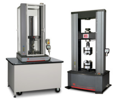
MTS Criterion<sup>®</sup> & MTS Exceed<sup>®</sup> Electromechanical Universal Test Systems