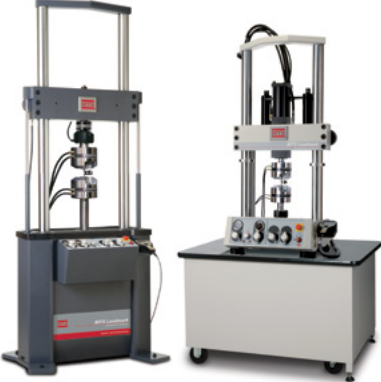
MTS Landmark® Servohydraulic Test Systems