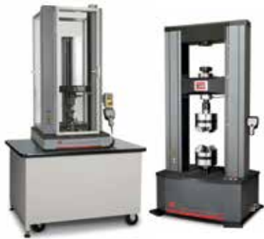
MTS Criterion® & MTS Exceed® Electromechanical Universal Test Systems