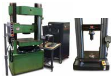
MTS ReNew™ Upgrade for Hydraulic & Electromechanical Test Systems