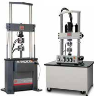
MTS Landmark® Servohydraulic Test Systems