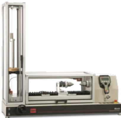
MTS Bionix® Electromechanical Torsion Test System

The tabletop Bionix EM Torsion System has been right-sized for orthopaedic and medical device testing applications. It is built to deliver the full range of torsional loads necessary for accurately simulating bone screw insertion and head twist-off, or testing the performance and durability of torque limiting screws, needle bonds, tubing and fine lead wires. High-performance components, such as a slotless AC servo motor, a digital sine drive amplifier, and a highly accurate direct drive provide users with precision control over the amount of torque applied to specimens throughout testing.