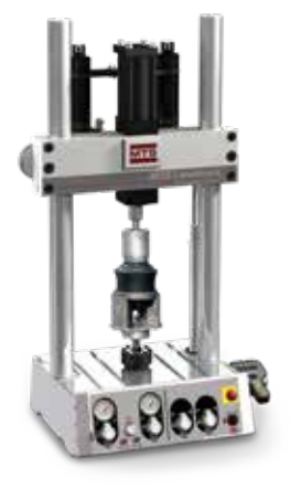
MTS Landmark® 100 Hz Elastomer Test System