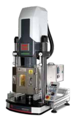
MTS Acumen® Electrodynamic Test Systems

Both the MTS Acumen* and the MTS Landmark* test systems are ideal for conducting dynamic mechanical analysis (DMA) of polymers per ASTM D5023. They offer a variety of force capacities and deliver up to 100 Hz (covering three decades) of precise frequency controlled test protocols to accommodate a wide variety of DMA and other fatigue testing needs. The compact MTS Acumen systems' electrodynamic actuation consumes less energy than other technologies, and provides a clean, quiet, and cost-effective system operation. The MTS Landmark 100 Hz Elastomer Test System is a tabletop system that features MTS servohydraulic actuation technology, and is the preferred test system when other requirements demand higher force capacities.