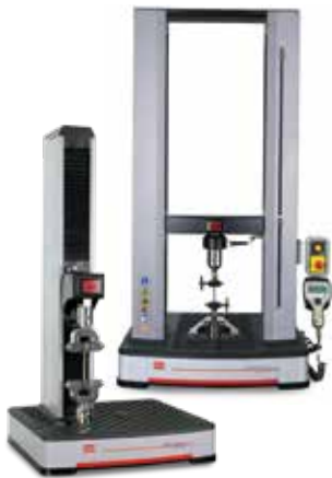
MTS Criterion® Electromechanical Universal Test Systems

Both the premium MTS Criterion® and the economical MTS Exceed® universal testing machines are ideal for flexural testing of unreinforced and reinforced plastics and electrical insulating materials per ASTM D790. These test systems come in a variety of force capacities and frame styles, ranging from 1-column tabletops to larger 2-column floor-standing models. The 30kN and 100kN models also have dual zone test spaces to reduce set-up times if you frequently change test requirements. And as an alternative to a new load frame, you can modernize the software and controls of your old test system with an MTS ReNew™ Upgrade.