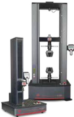
MTS Exceed® Electromechanical Universal Test Systems