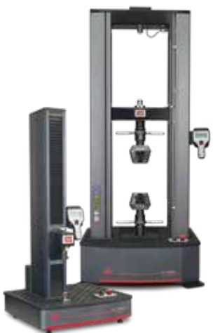
MTS Exceed® Electromechanical Universal Test Systems