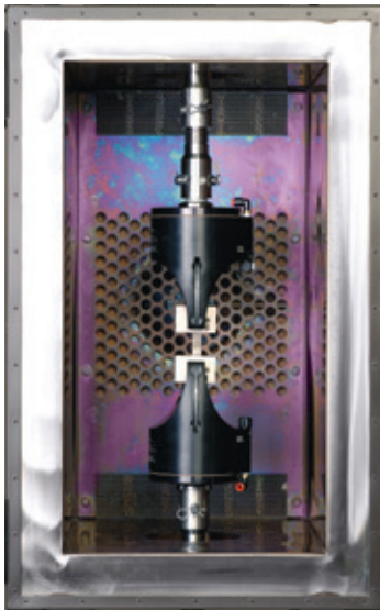
Load extension kit and pneumatic grips in an environmental chamber