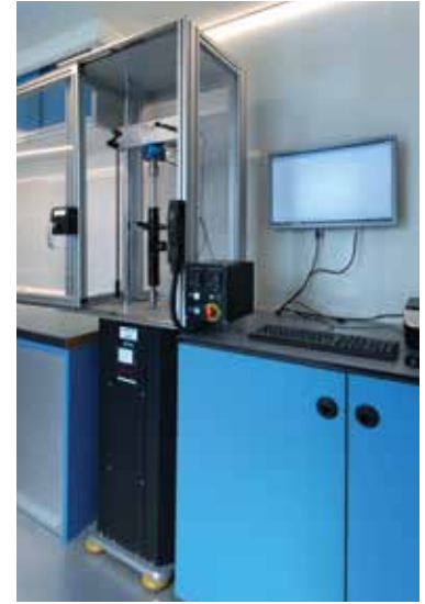
MTS Roehrig EMA damper test system deployed in Tenneco mobile ride tuning truck.

“Crank dynos are purely mechanical systems, so changing the stroke length is a mechanical job,” Moria said. “And they only offered velocities up to 1.5 m/s. EMA damper systems have longer stroke lengths and velocities up to 2 or 3 m/s if necessary. It’s very easy to make these changes, so test efficiency is higher and we can provide much more flexibility for our customers.”