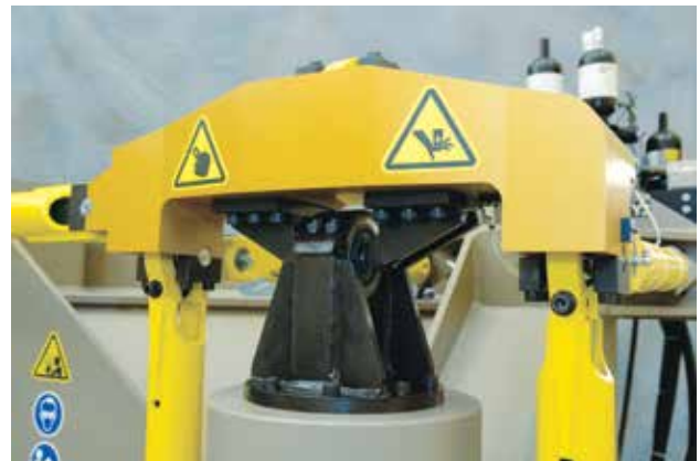
A low-friction actuation scheme ensures utmost control and data integrity.