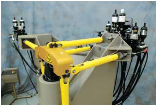
An easy-access mounting assembly lets you quickly install and remove specimens.