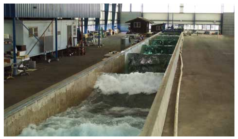
Large Wave Flume

©2021 MTS Systems 100-241-796 OUSmakingWaves • Printed in U.S.A. • 09/21