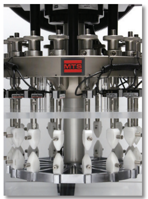
MTS MSF15 Fixture with Low Mass Grips