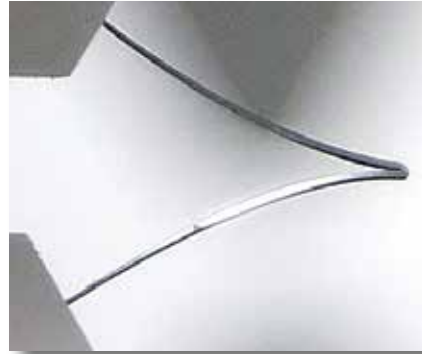
NiTi Stent Apex Sample

With the MTS FlexTest® controls and TestSuite™ software, you can trigger data acquisition to capture individual sample fracture data without affecting data acquisition on the other samples. The software detects load drop off and can notify you, allowing you to make decisions based on the load change. Based on the notification, you may want to trigger data acquisition to create a specific data file for that sample. This feature allows you to isolate the data you need, eliminating tedious sorting through great amounts of data to find the relevant data, which saves a tremendous amount of time.