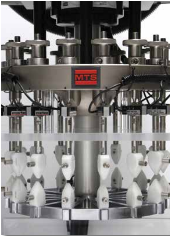
MTS MSF15 Fixture with Low Mass Grips