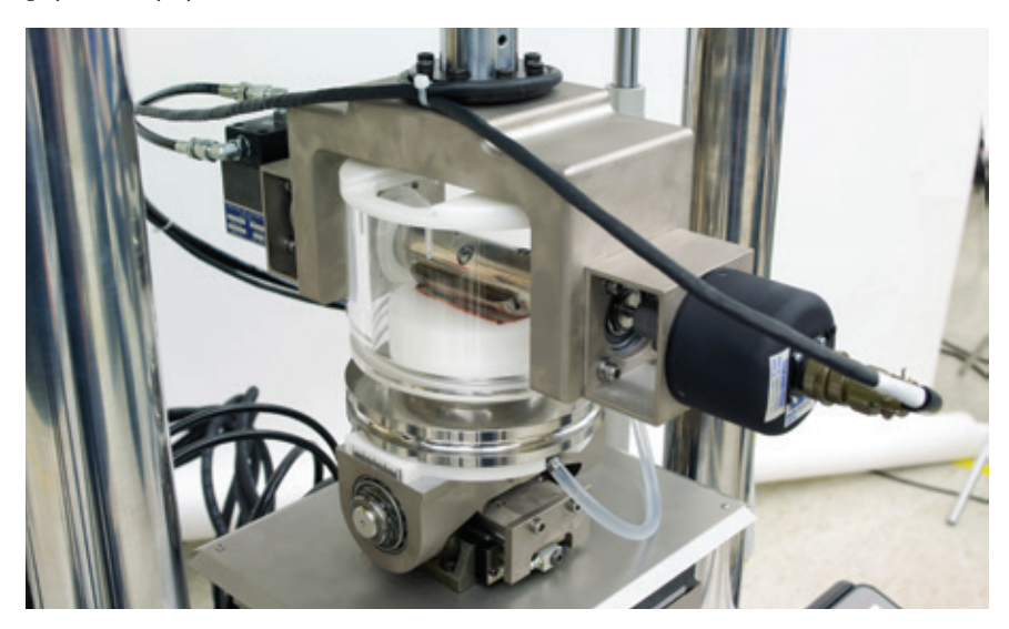
Bionix Knee Wear Subsystem

Using the FlexTest controller, the operator can design the required loading and displacement profiles to evaluate the wear characteristics of designs and materials.