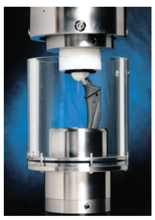
Bionix Femoral Fatigue Subsystem

With this economically priced fixture, this axial-only test can be performed on any Bionix system. The fixture includes the load cell adapter, potting cup base, chamber and seals, chamber holder and thrust bearing and lower housing assembly.