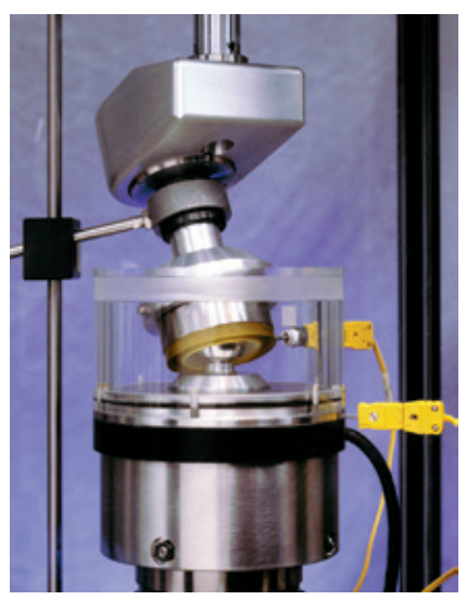
Bionix Single-Station (Biaxial Rocking Hip) Simulator Subsystem

A special alignment fixture assures proper positioning of the femoral ball and acetabulum cup during setup and throughout the test.