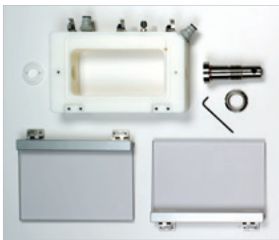
The Bionix EnviroBath is easy to disassemble, clean and maintain.