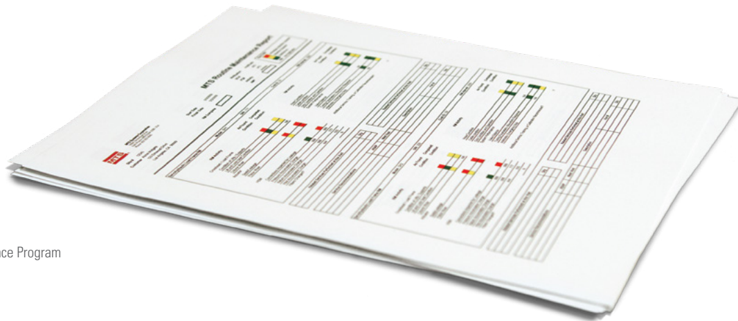
Report generated for MTS Routine Maintenance Program

MTS offers routine maintenance services for all testing equipment, and we offer specific interval packages for load frames, hydraulic power units (HPUs) and controllers. These packages are designed to provide maintenance at the appropriate times based on operational hours of use.