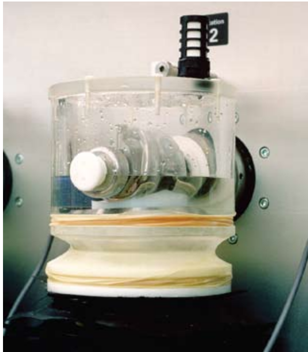
Optional High Displacement Fixturing