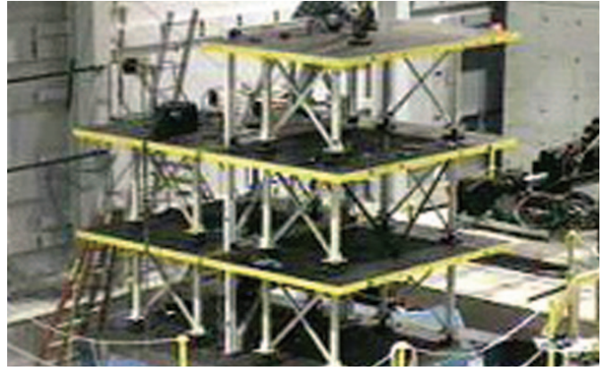
Shake table test of steel structure with advanced braces (zipper frames)

facility for nonstructural component simulation, composed of a two-story shake table with strokes of +/- one meter and velocities of up to three meters per second.