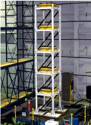
Testing of added clamping system in 5-story structure

MTS helps a pioneering university lab pursue advanced civil structural testing and simulation.