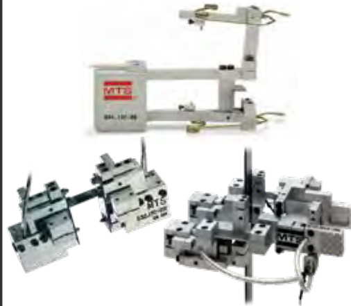
Clip-on Axial, Biaxial or Axial Averaging Extensometers for Tension, Compression, Tensile Shear & Fatigue Testing