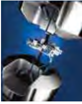
ISO 527-4&5, ASTM D3039, EN 2561 & EN 2597