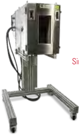
Environmental Simulation Systems