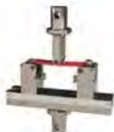
ISO 15114, ASTM D7905 & EN 6034