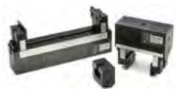
ISO 14125, ASTM D790, ASTM D6272, ASTM D7264, EN 2562 & EN 2746