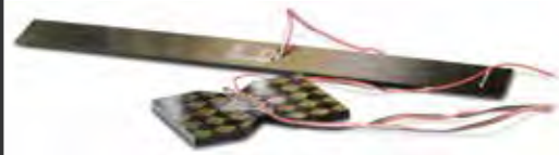
Strain Gages for Tension, Compression & Shear Testing