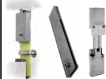
ASTM D5961, ASTM D6873 & ASTM D7248