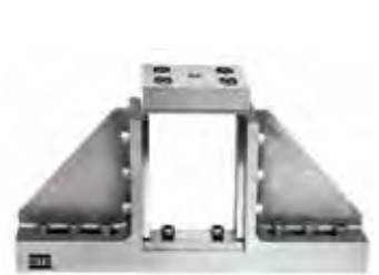
ISO 18352, ASTM D7137 & EN 6038

Composite materials testing labs routinely need to test per international standards or tailored manufacturing standards, but they also need to be able to run tests that have never been performed before.