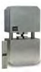
ISO 14126 & ASTM D3410