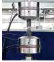
ISO 13003 & ASTM D3479