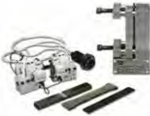
ASTM D695 & prEN 2850