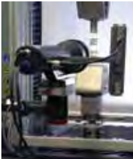
ISO 14129, ASTM D3518 & EN 6031