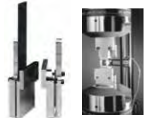
ASTM D5766, ASTM D6742, EN 6035, ASTM D7615, ISO 12817 & ASTM D6484