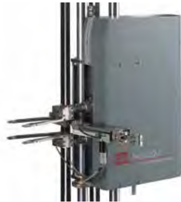
Automatic Extensometer for Tension & Tensile Shear Testing