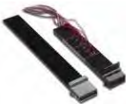
ISO 15024, ASTM D5528, EN 6033 & ASTM D6115