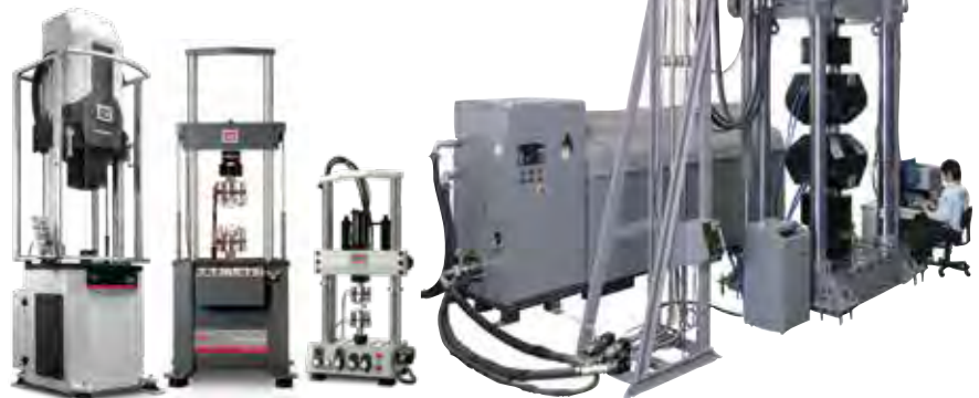
Fatigue & Fracture