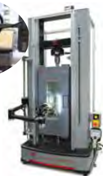
Non-contacting Optical & Video Extensometer for Tension, Tensile Shear, Fatigue & Fracture Testing