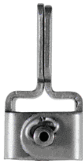
Model 10A, jaws parallel