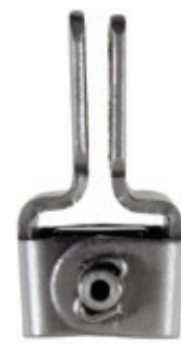
Model 10B (with no rubber face material), jaws parallel