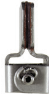
Model 10B, (with rubber face) jaws parallel