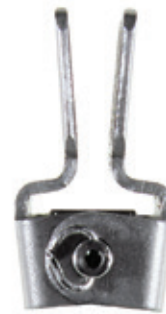
Model 10B, fully open