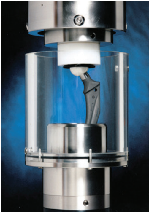
Bionix Femoral Fatigue Subsystem

With this economically priced fixture, this axial-only test can be performed on any Bionix system. The fixture includes the load cell adapter, potting cup base, chamber and seals, chamber holder and thrust bearing and lower housing assembly.