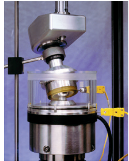
Bionix Single-Station (Biaxial Rocking Hip) Simulator Subsystem

A special alignment fixture assures proper positioning of the femoral ball and acetabulum cup during setup and throughout the test.